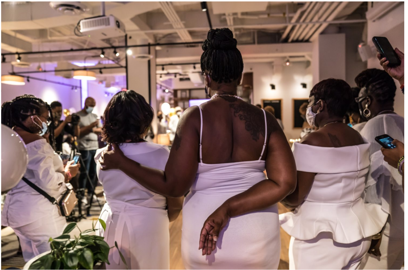
Attendees gather in a circle to pay homage to their loved ones.