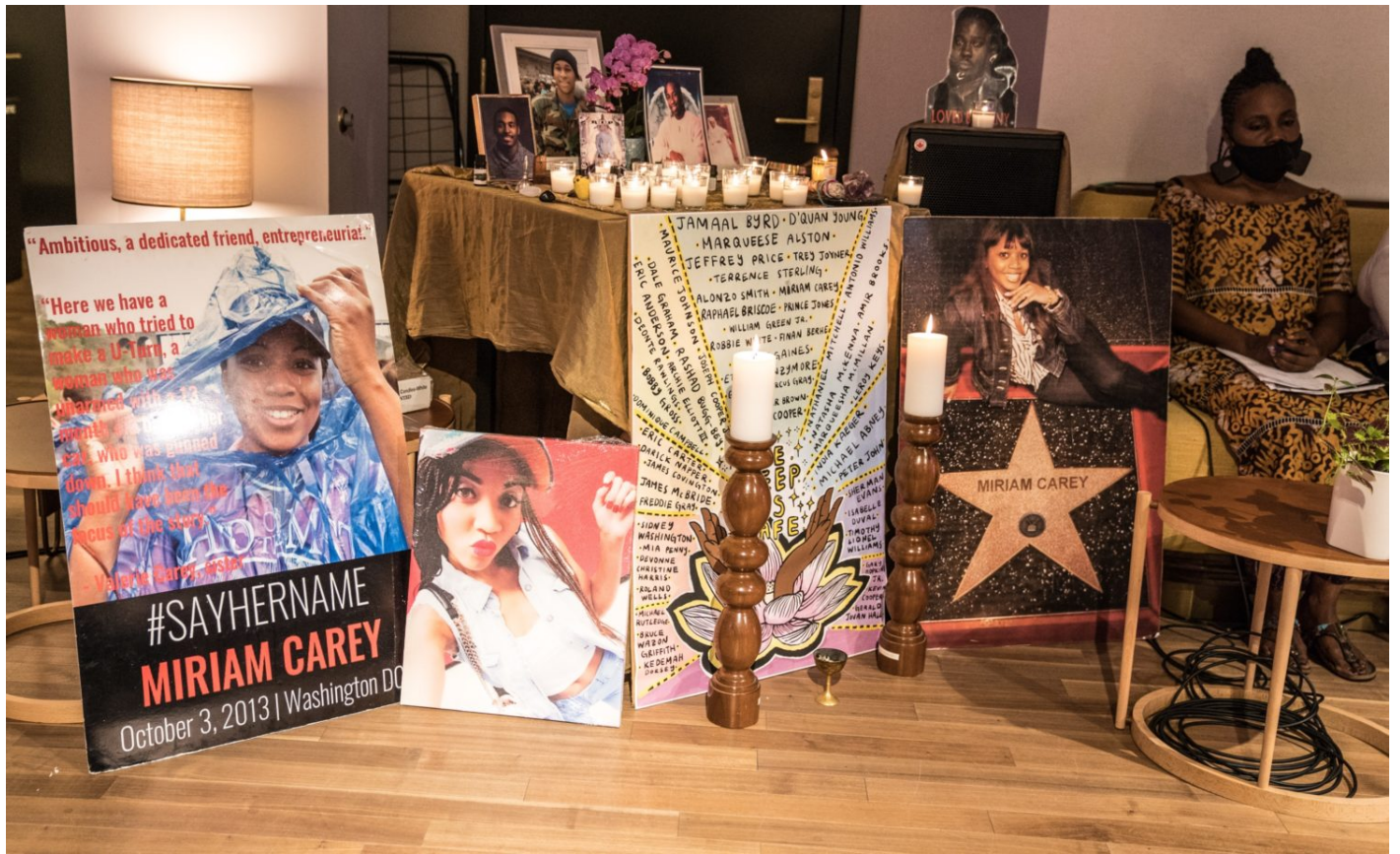
An altar with photos, candles, and artwork honors the victims of police brutality.